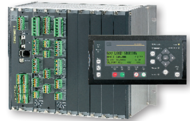
Power Management System, DM-4 Marine